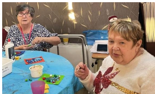
CHRISTMAS CARD MAKING AND BAUBLE DECORATING